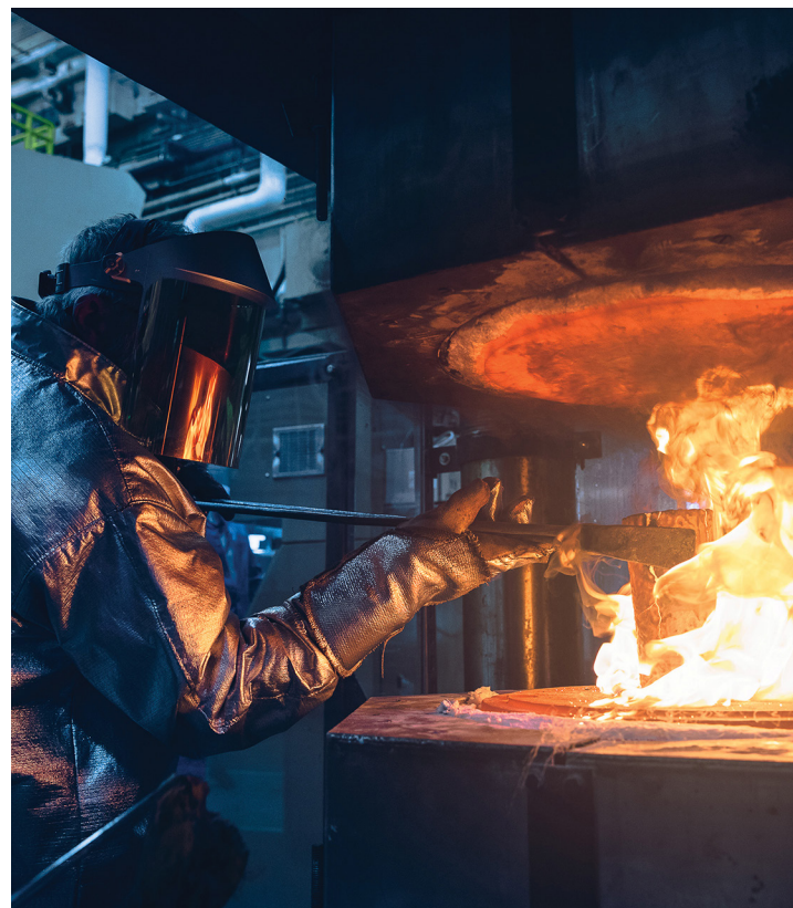
The Advanced Materials & Coatings Technology team utilizing the forge lab in Niskayuna, New York.

The global energy system is undergoing a major transformation. The world needs more energy, and a larger portion must be electric power for people and communities around the world to thrive. Put simply, economic competitiveness and national security are dependent on the advancement of reliable, affordable, and sustainable electricity. Nations that scale electricity generation and modernize grid infrastructure will unlock faster growth, achieve higher living standards, and develop more competitive industries.