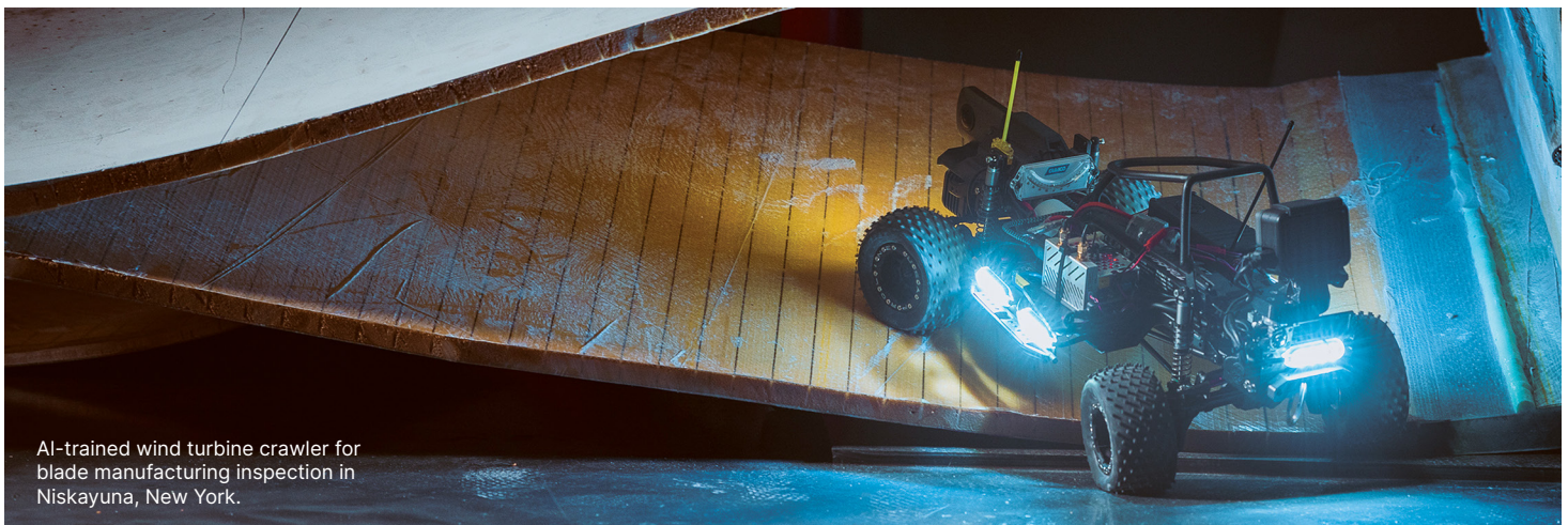
AI-trained wind turbine crawler for blade manufacturing inspection in Niskayuna, New York.

2025 is an early stage of this multi-decade transformation of our electrical system. Opportunities abound for GE Vernova to create long-term value. We are building a unique, purpose-built, differentiated company that provides investors the best opportunity to gain exposure to the electricity supercycle.