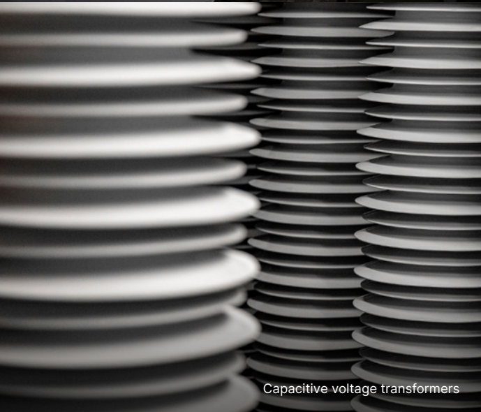
Capacitive voltage transformers