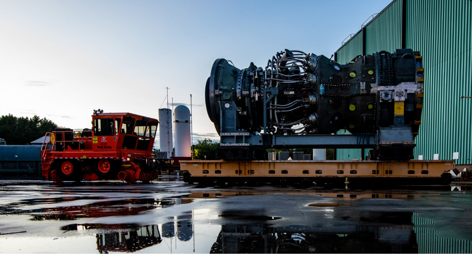
A 7HA.03 gas turbine leaving Greenville, South Carolina.