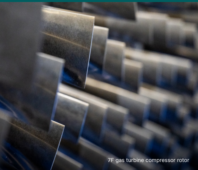
7F gas turbine compressor rotor