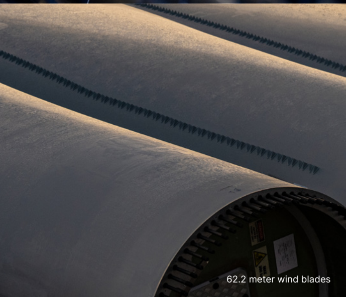
62.2 meter wind blades