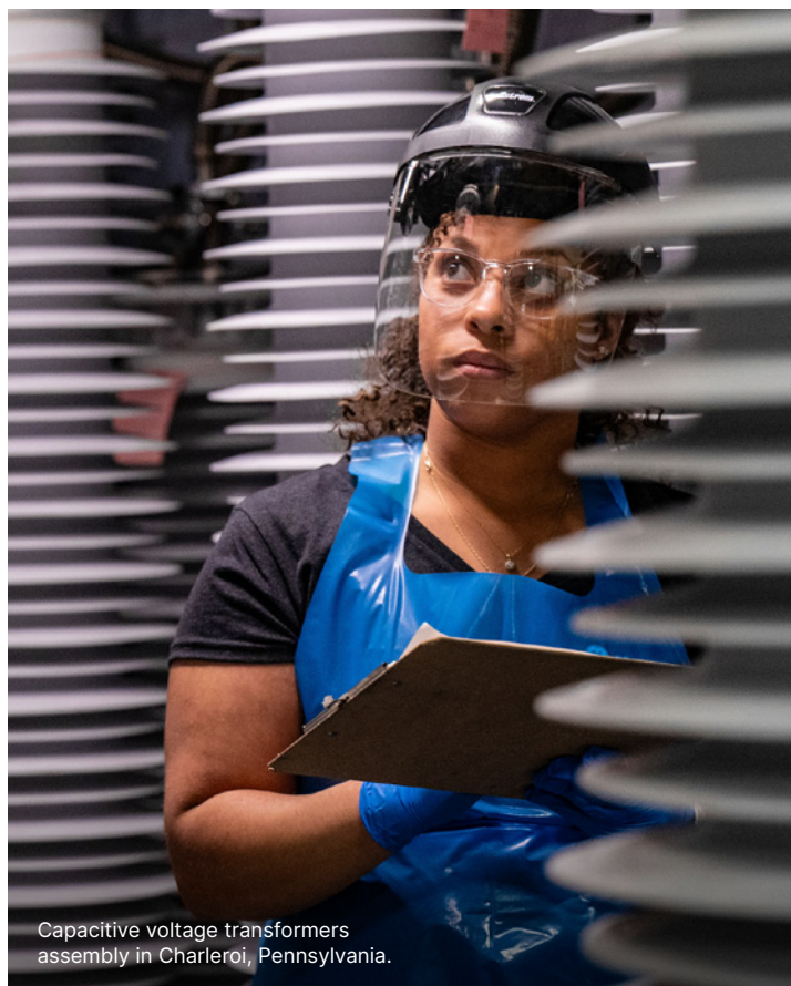
Capacitive voltage transformers assembly in Charleroi, Pennsylvania.

Our focus is to maximize output from our existing factories through the deployment of lean lines, robotics, and advanced automation. Lean continues to enable us to increase output. Lean is embedded in our culture and drives our operational execution every day, and while we are pleased with our progress, we are still early in this journey.