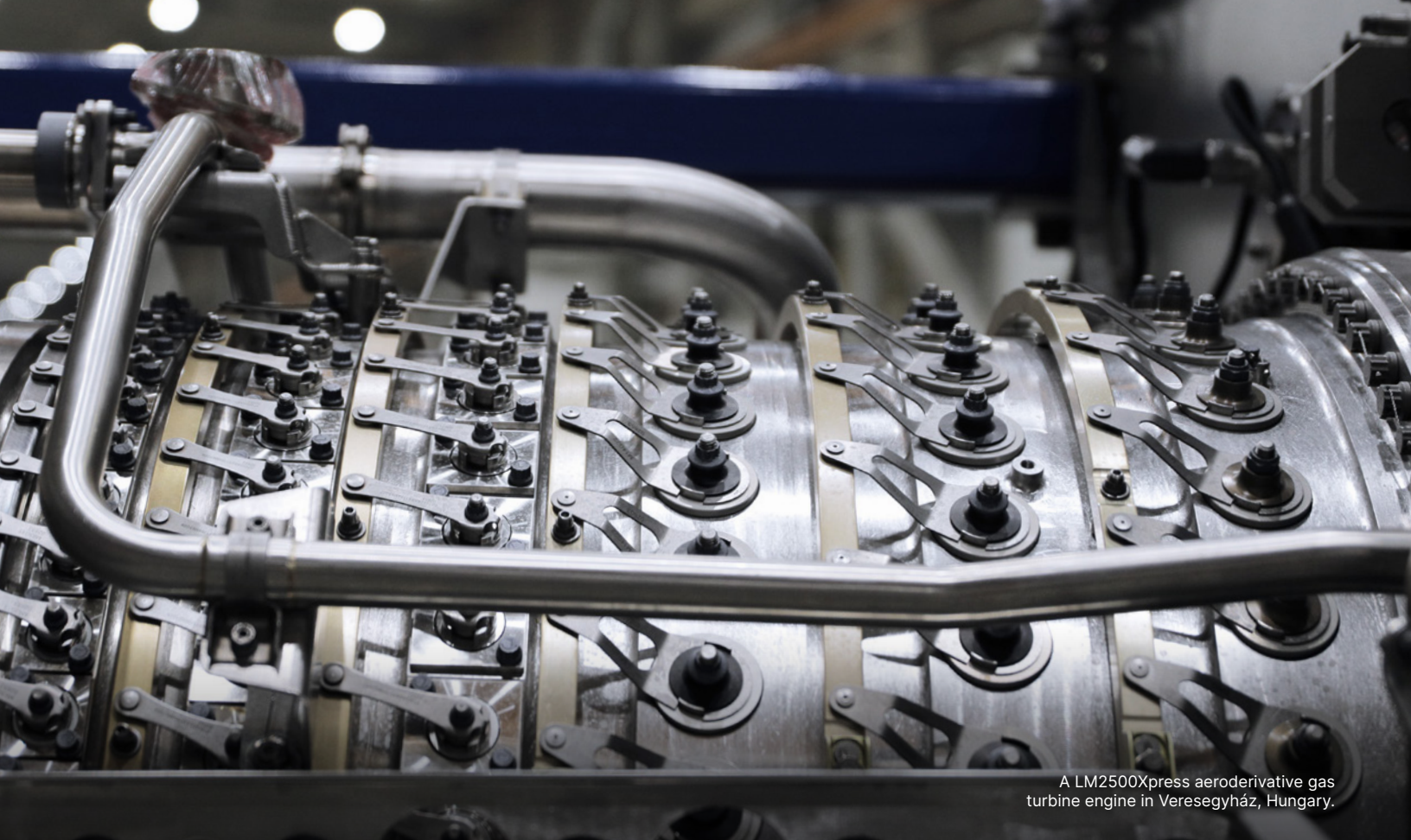
A LM2500Xpress aeroderivative gas turbine engine in Veresegyház, Hungary.